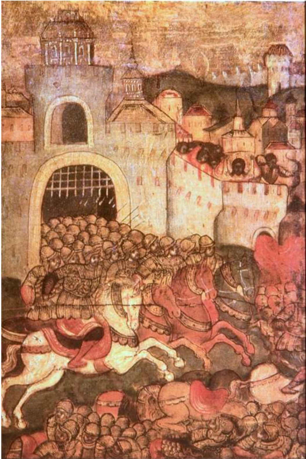
Fig. 5 - The Mandylion on the walls of Edessa - Details of the Savior's icon with twenty scenes by L. Stepanov and S. Kostromitine, iconostasis of the Cathedral Church of the Redeemer, the Kremlin, Moscow, 17 th century.

was extracted and a procession on the walls of the city organized. Miraculously, a fire that the Persians had built turned upon them who fled in defeat.