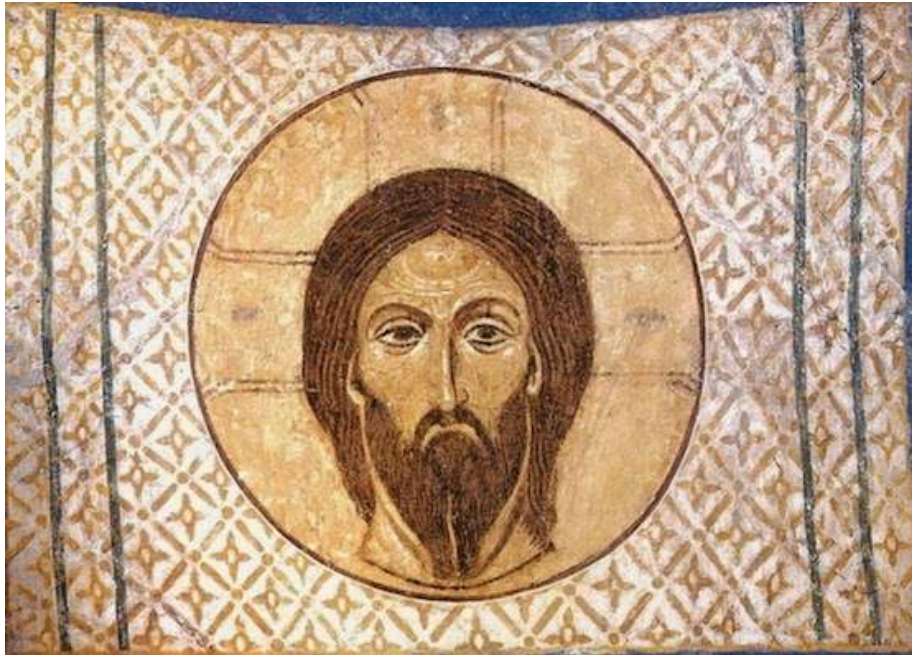
Fig. 8 – Mandylion – Pskov, Transfiguration Cathedral, Mirozhsky Monastery, 12 th century.

The big eyes of Christ Panteropto (meaning He who sees everything), the hair gathered in long strands, the beard divided in two and the lock of hair on the forehead are features which can be identified on the Shroud's image and became modular traits for iconographic painters of any time and any country.