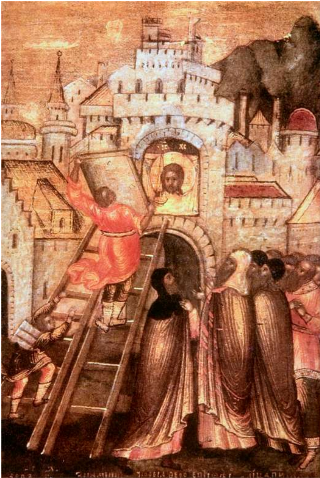
Fig. 4 – The Mandylion being hidden - Details of the Savior's icon with twenty scenes by L. Stepanov and S. Kostromitine, iconostasis of the Cathedral Church of the Redeemer, the Kremlin, Moscow, 17 th century.

The sacred image was forgotten for centuries until Khosrow II, king of Persia, after assaulting all Asian cities, besieged Edessa. The city was about to be conquered, when Eulabius, the bishop of the city, had a vision who revealed to him the secret of the relic. He opened up the wall and the image appeared: the lamp, still burning, had helped imprint Christ's image on the tile covering it. The relic