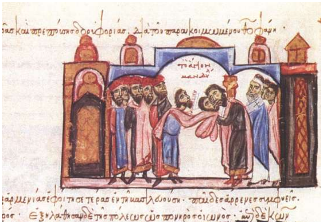
Fig. 6 – Arrival of the Mandylion in Constantinople - Manuscript of Johannes Skylitzès, National Library of Madrid, 12 th century.

As all the most beautiful things were flowing into the imperial city - continues the Synaxarium - it was also God's will that that sacred, ineffable icon should become part of his treasure. Many Byzantine emperors tried to get hold of the Edessean relic which, meanwhile, fell into Saracens' hands. Eventually, emperor Romanus I Lecapenus, after long negotiations, managed to obtain it at a high price: a payment of twelve thousand silver dinars, the liberation of two hundred Saracen prisoners and the imperial army's promise to refrain from setting foot in Edessa and its property. Having learnt of the agreement, the Christian community of Edessa rebelled but had to give in to reasons of State. Therefore the relic, after a few stops, was taken to Constantinople, along with Jesus' signed letter to king Abgar, in a procession in which, among many dignitaries, the bishops of Samusata and Edessa also took part. Miracles were being worked along the way: when they got to the district of the Optimatoi, to the Church of the Mother of God (Theotòkos) called "the Church of Eusebius", he was applauded by huge crowds and many people suffering from various diseases were healed, among whom a possessed man who, immediately after seeing the relic, began shouting: "Receive your glory and honor and joy, Constantinople, and you, Porphyrogenitus, your empire".