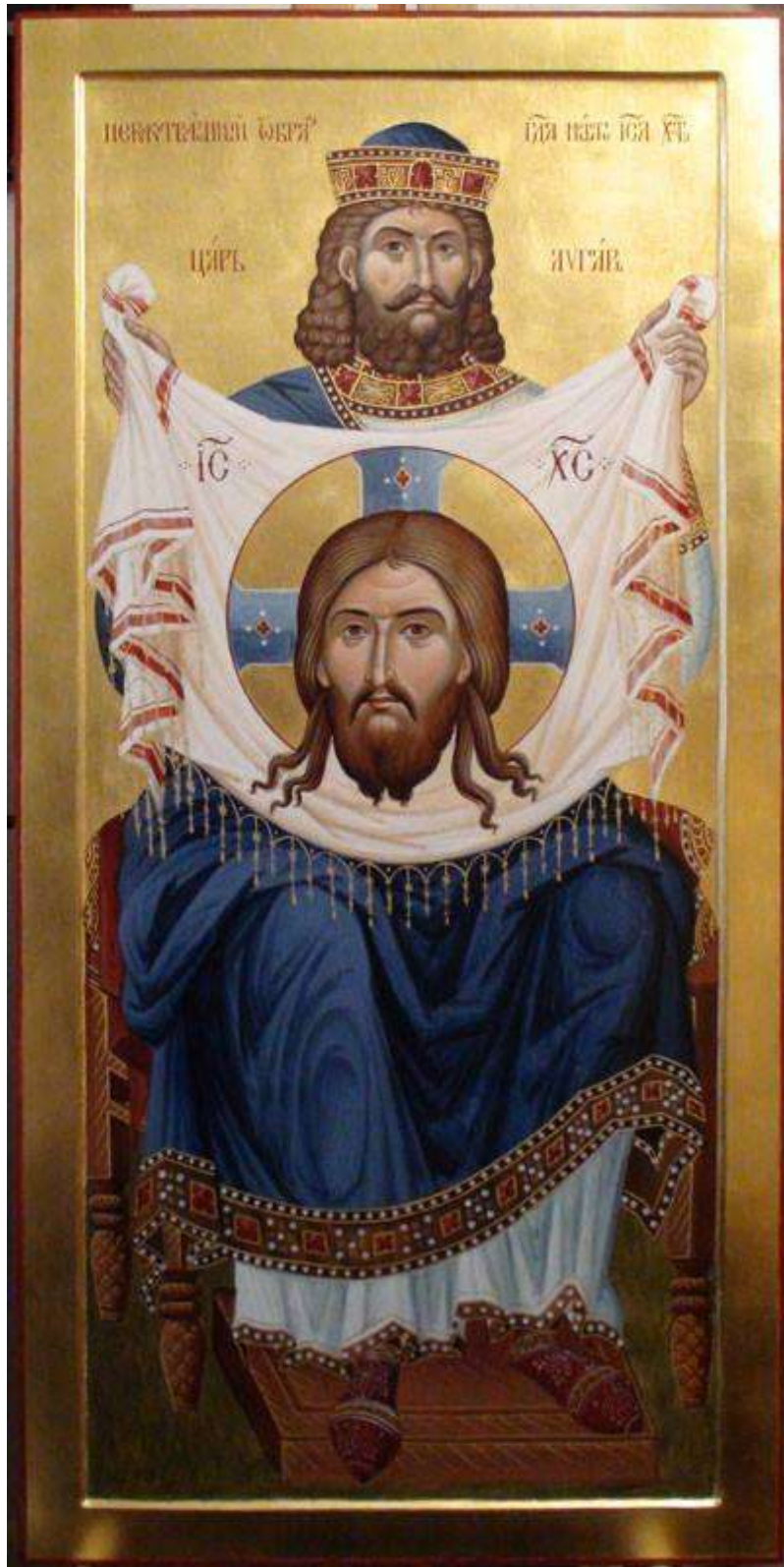
Fig. 3 – King Abgar and the Mandylion – Contemporary icon, Russia, 21 st century.

However, as the Synaxarium reports, Abgar's grandson, who had returned to the worship of the idols, wanted to destroy the precious relic. In order to save the Mandylion, the Bishop of Edessa, having been warned in a dream by an angel, had the rounded hollow secretly bricked up with a tile and a little burning lamp placed before it.