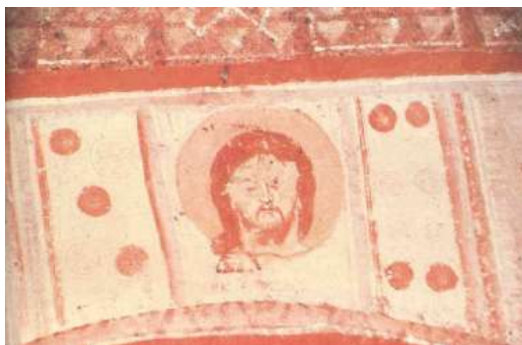
Fig. 9 – Mandylion – Sakli, Goreme, Turkey, 12 th century.

In later painted versions, the oculus became the halo (photostaphanos) surrounding the head of Christ and inside which is the cross pattée that always identifies the image of the Lord.