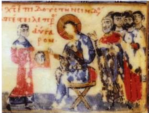
Fig. 1 – Jesus delivering His portrait to Ananias – Stories of King Abgar, cod. 382, Historical Museum, Moscow, 1063.

Abgar Ukkama, to Jesus, the Good Physician, who has appeared in the country of Jerusalem. My Lord: Peace. I have heard of Thee and of Thy healing, that it is not by medicines and roots Thou healest, but by Thy word Thou openest the eyes of the blind, Thou makest the lame to walk, cleansest the lepers, and makest the deaf to hear. And unclean spirits and lunatics, and those tormented, them Thou healest by Thy word; Thou also raisest the dead. And when I heard of these great wonders which Thou doest, I decided in my mind that either Thou art God, who hast come down from heaven and doest these things, or Thou art the Son of God, who doest all these things. Therefore, I have written to request of Thee to come to me who adore Thee, and to heal the disease which I have, as I believe in Thee. This also I have heard, that the Jews murmur against Thee and persecute Thee, and even seek to crucify Thee, and contemplate treating Thee cruelly. I possess one small and beautiful city, and it is sufficient for both to dwell in it in quietness.