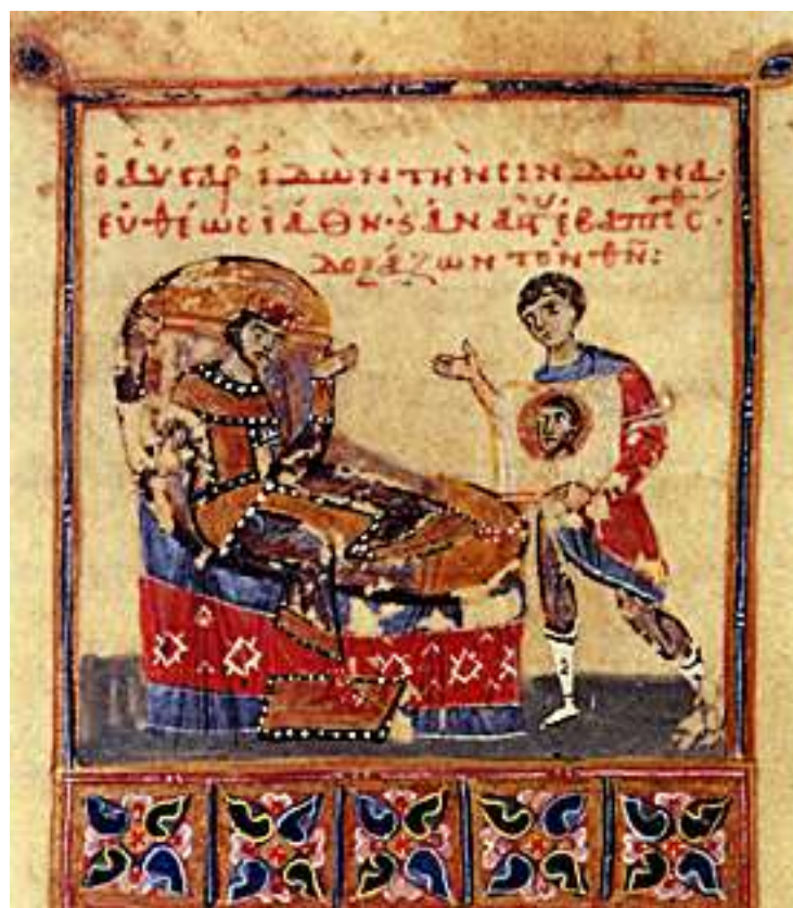
Fig. 2 – Ananias delivering the portrait of Jesus to King Abgar – Stories of King Abgar, cod. 382, Historical Museum, Moscow, 1063.

Before giving the letter to Ananias, Christ affixed seven seals below bearing words in Hebrew which, according to the Synaxarium, mean “wonderful view of God”. Abgar received the letter and portrait with great honor and profound veneration, and was quickly healed of his afflictions, except from some leprosy traces on his face.