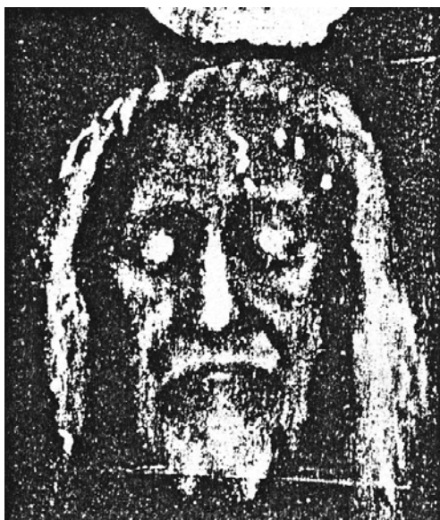
Plate 9. Negative photograph of another rubbing image. In this instance the iron-oxide pigment was made by calcining green vitriol according to a twelfth-century recipe. The "blood" trickles were added with tempera paint