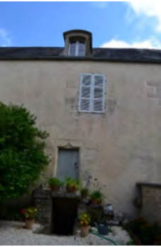
Fig 4. Base of the original strong tower