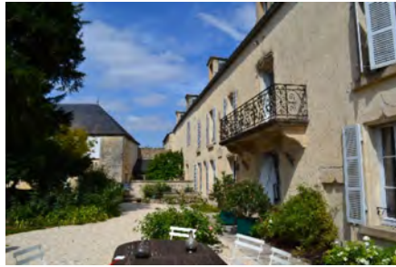
Fig 5. The keep was to the left.