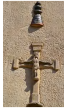
Fig 6. Finial and cross 1656?