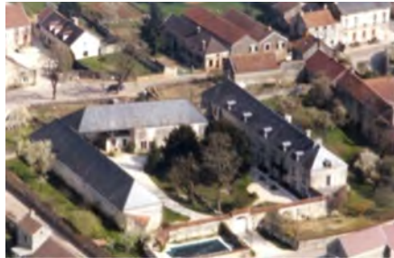
Fig 3. Present day Chateau de Savoisy (1) 27