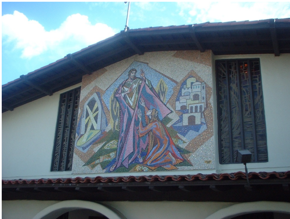
Camarillo, California (photo taken by P. C. Maloney, Sept. 17, 2005)