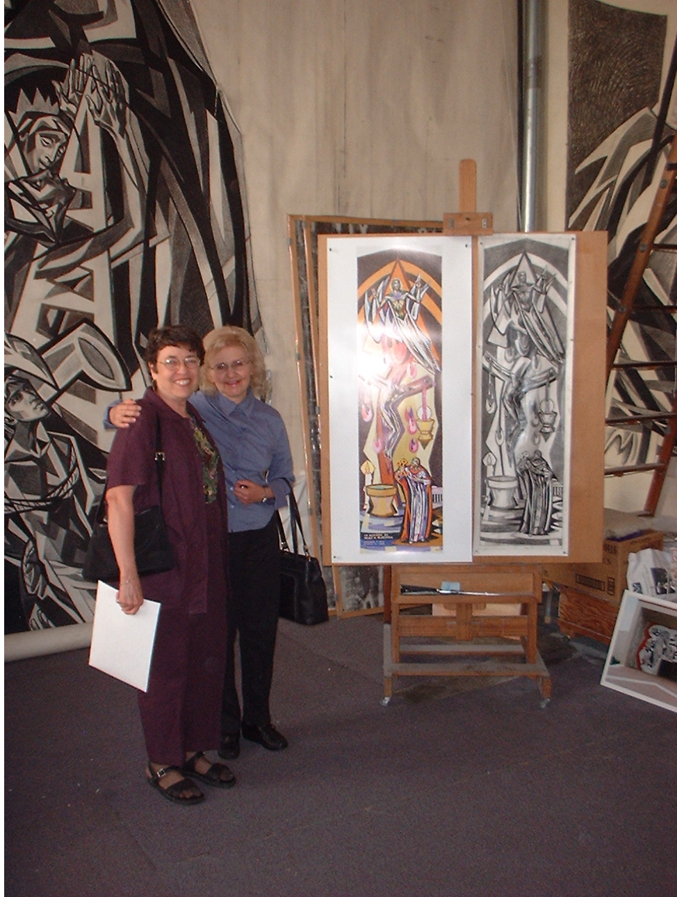
Piczek Studio (photo by P. C. Maloney, Sept. 19, 2005)