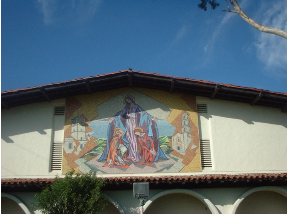
Camarillo, CA (photo taken by P. C. Maloney, Sept. 17, 2005)