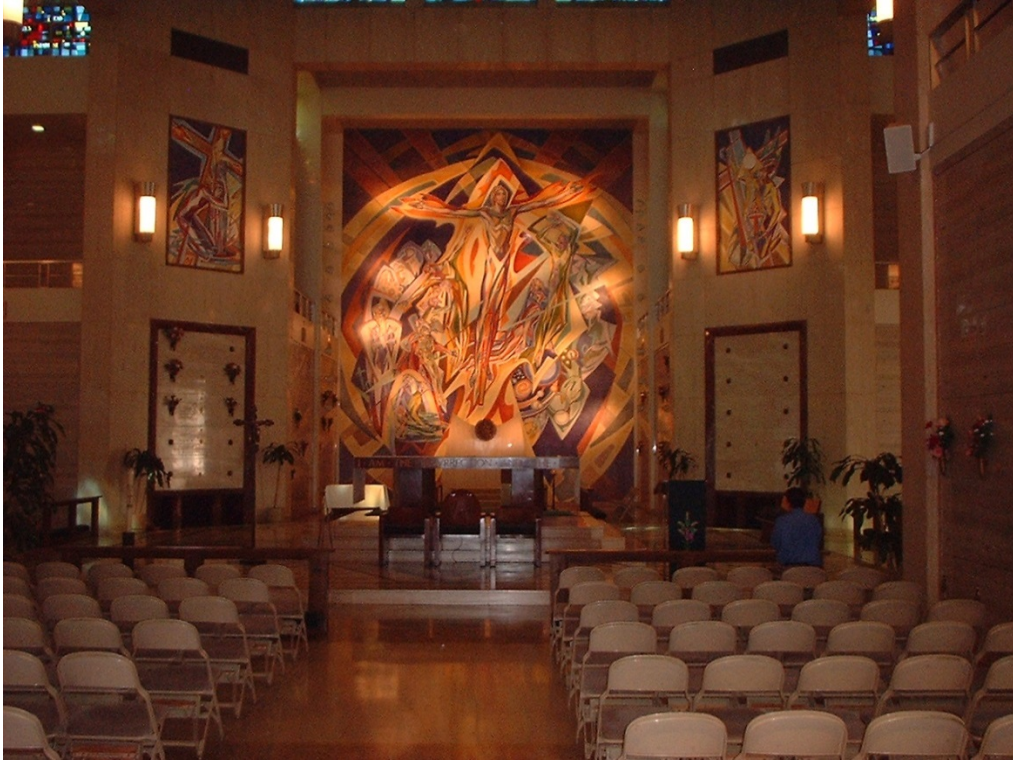
The chapel in the Holy Cross Cemetery, Culver City, CA (photo by P.C. Maloney, 9/19/2005)